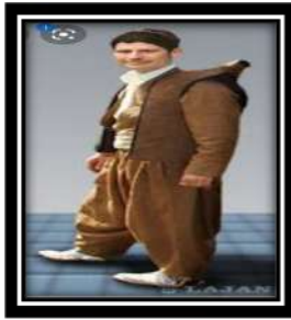
Photos No. (10) (11) Men's Traditional fashion in the Northern Regions